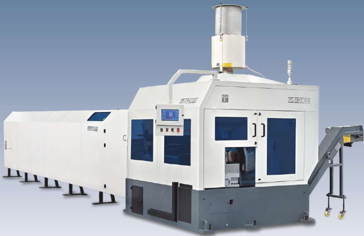
NC Carbide Circular/Disc Saw Machine