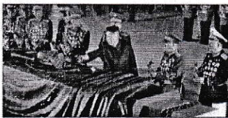
North Korea's leader Kim Jong Un (C) visiting the Fatherland Liberation War Martyrs Cemetery in Pyongyang to mark the 68th anniversary of the end of the Korean War.

SEOUL: South and North Korea have restored hotlines that Pyongyang severed a year ago when ties deteriorated sharply and the two countries' leaders are renewing efforts to rebuild relations. South's presidential office said on Tuesday.